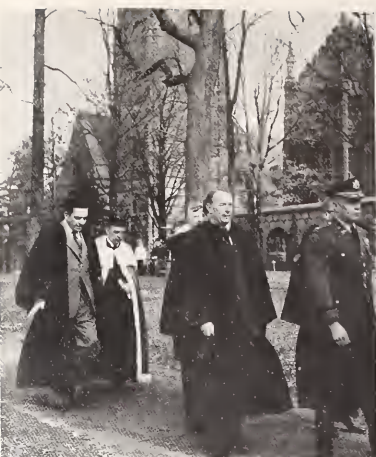
CHARTER DAY: Tennessee Governor Frank G. Clement is shown marching in an academic procession on Charter Day, Jan. 6. The governor made the principal address.

The Acolytes Guild will meet for the purpose of electing new officers Friday, Jan. 17. The meeting will be held at the Chaplain's House at 7:15 p.m.