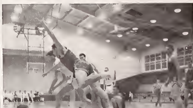
KA (left) and Phi Deltas (right) are seen in action during the intramural volleyball season.

Even before the volleyball competition ended, fraternities were busy grooming and practicing their basketball teams. Judging from the pre-season practice games the season shapes up as one of close competition with KA, Beta, and the Phi sporting strong contenders. Predicted strong ATO has yet to show its power. In any case no team can be validly discounted in the always unpredictable intramural program.