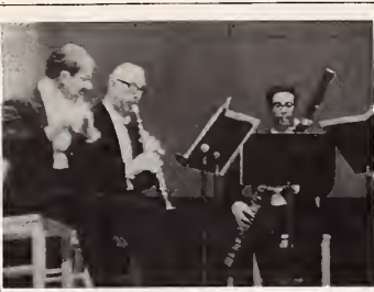
The Mozarteum Woodwind Quintet of Argentina, presented by the University Concert Series, rendered five varied compositions in Quarry Hall Sunday night.

The University further alleges that certain parcels of land within the do- main have been leased to private in- dividuals and that these "leasehold in- terests" are also exempt from taxation. This claim is made on the grounds that