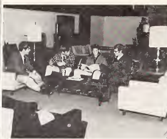
Students relax and talk in renovated Convocation Hall.