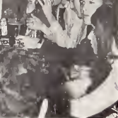
Happy times are had by all at the Happy Hour at Sewanee Inn Friday