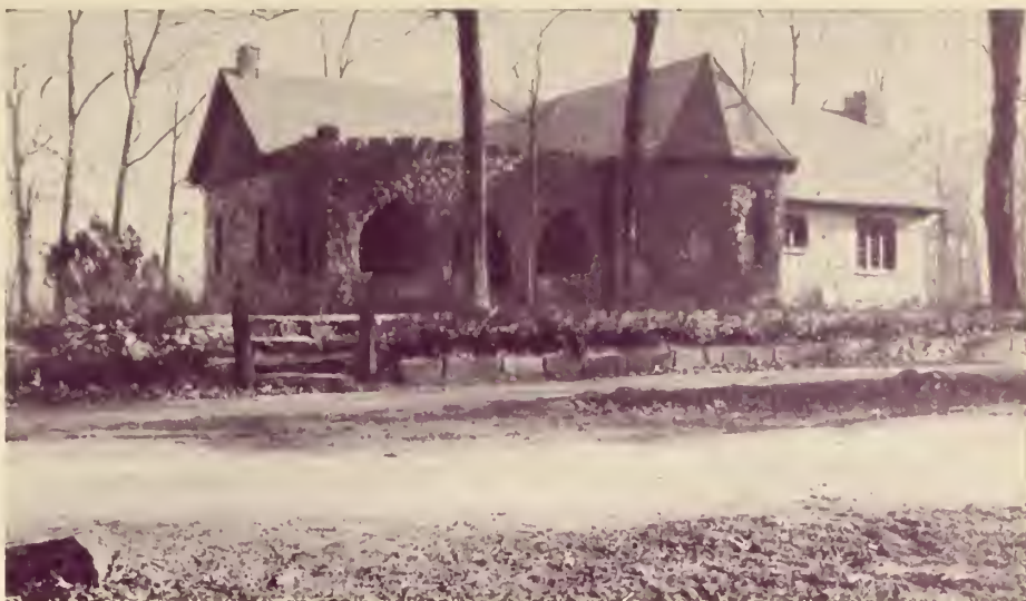
S. A. E. HOUSE SHOWING NEW ADDITION