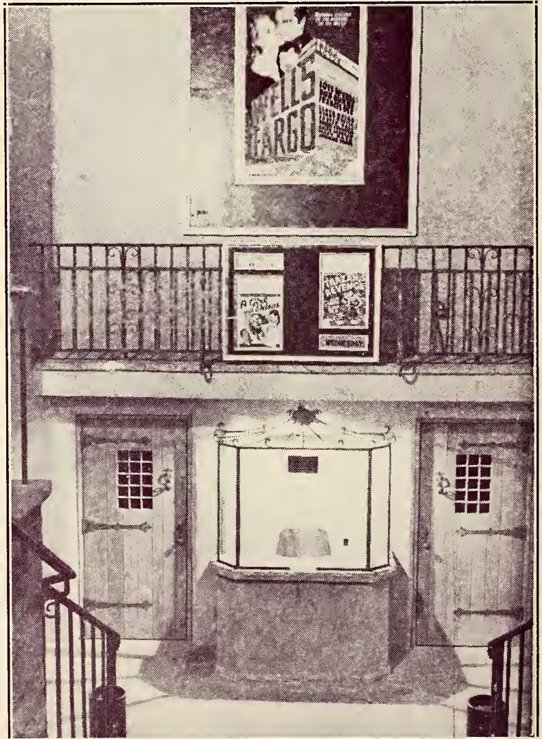
Entrance to New Sewanee Union Theatre

THE INTERCOLLEGIATE DEBATE SCHEDULE has been completed. Debates will be held in Sewanee with Drake University, Springhill College, Davidson College, St. Edward's University, Allegheny College, Annandale-on-Hudson (Columbia University), University of Cincinnati, Waynesburg College and Tennessee Polytechnic Institute. Trips will be taken on which the teams of Tennessee Polytechnic Institute, Davidson College, Southwestern, University of Ten-