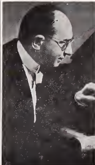
CONCERTIST STEPHEN KOVACS

He organized the famous Four Piano Ensemble, which toured the United