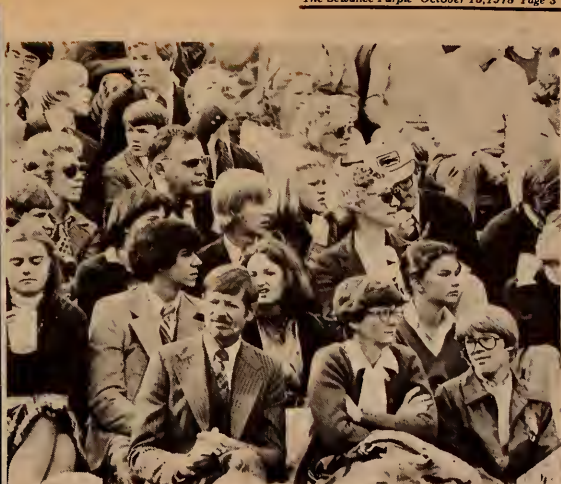
What are these people doing? What could they be waiting for? Another Sewanee varsity win? Does that explain their cheery and attentive faces? For the answers to these and any other questions about the Sewanee social scene, keep your drink full, try an occasional smile, go to all home football games and remember: THIS IS FALL PARTY WEEKEND.