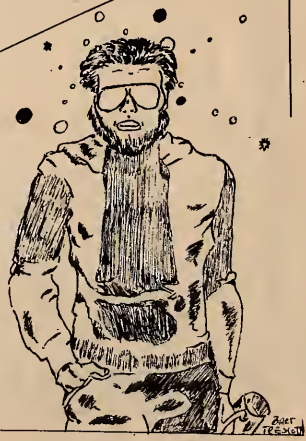
another kind of escape.....