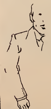
an apathetic artist.....

as far as saying that last week's Purple, or the lack thereof, was directly caused by an apathetic staff, myself included. Most students characteristically put unfavorable jobs off: human nature prevails to whatever extent an individual will allow it. But if you can't turn another Philosophy page, dad, blow it off! At the risk of supraliberalizing this college paper, I refer to Purple Volume C, Number 1, page four. "Go ahead and cut classes now and then, and do something different: a picnic, a hike, or whatever. Leave the Mountain sometimes—a trip to Nashville or a weekend camping. . . ." I think Gilmer hit upon something significant there. Our Sewanee community just has an inordinate amount of fascinating personalities and places, for to experience one iota of personal growth outside "Upper Academia" almost necessitates an occasional shirking of duties. Please, campers, do not take this editorial for an advocacy of slackness. I feel Sewanee's dogmatic demand for mental prowess will never let us slide to an irreparable, Buffettesque state of laid-back(ness). Whatever our school's traditionally high standards demand, the student body must produce, thus an equilibrium between play and academics is reached.