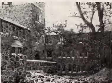
Approaching completion, McCrady Hall, complete with turret, will house residents of Barton, Seiden, and Woodland.