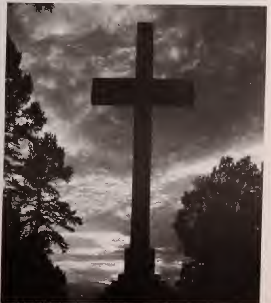
The School of Theology's prayers for a win in football have been unanswered so far. "I don't want to give anything away, but let's just say that we're getting ready to go Old Testament on the fraternities. The time for being nice is over."