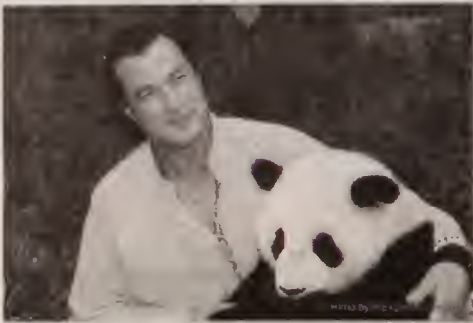
Figure 1: His seemingly kind nature is simply a front. Immediately after this picture was taken, Seagal broke the Panda's neck