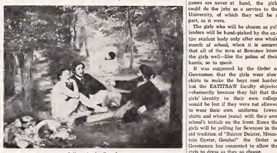
Splinter in the Grass?

It was suggested by the Order of Government that the girls wear short skirts to make the boys root harder, but the EATITRAW faculty objected vehemently because they felt that the girls' identity to their own college would be lost if they were not allowed to wear their own uniforms (sweat shirts and wheat jeans) with their own school's initials on the front. Since the girls will be yelling for Sewanee in the old tradition of "Roister Doister, Mountain Oyster, Gotcha!" the Order of Government has consented to allow the girls to dress as they choose.