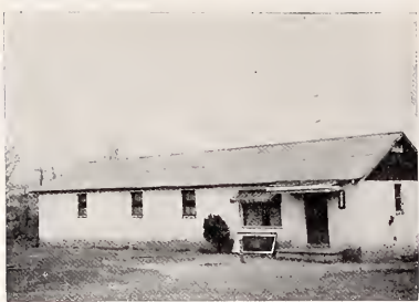
THE LOG CABIN: Notorious vice pocket, den of thieves, desperado' lair, and seat of "The Spider's" worldwide Cosa Nostra operations.