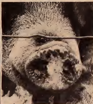
A Gailorburger to go...