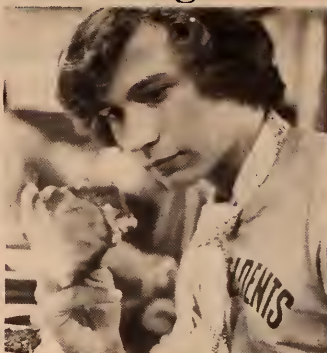
What... a porkchop?