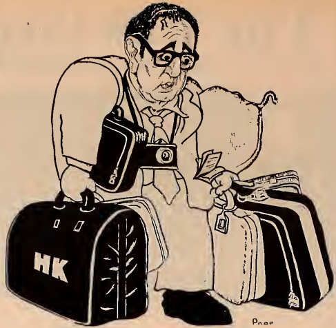
OUR MAN IN HANOI . . . . .