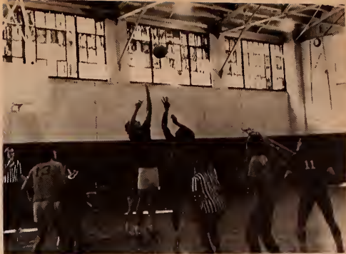
Intramural action in old gym

— Cam Cantrill Dick Greff Sports Editors