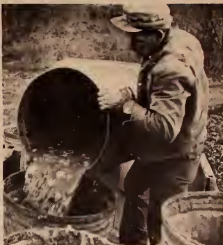
Taking out the chow...