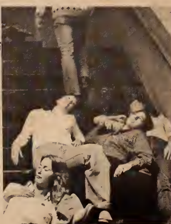
On October 31, 1981 the med Burper ambushed a crowd of Purple people and took control of the school newspaper.