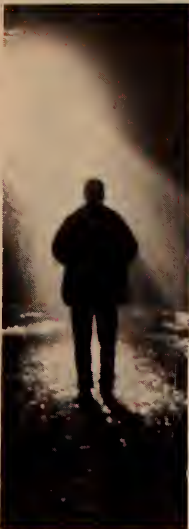
The "Mad Exponentist". Where will he strike next?

The walls and quilts of Sewanee have been relatively safe of late as the mad exponentist has apparently locked himself in an office in Woods Lab. Police have surrounded the area but the suspect, who is allegedly living on popcorn and No-Doz, refuses to be apprehended. "Not 'til I comp!" chemistry students hear during lab sessions. "After I comp I'll be through!"