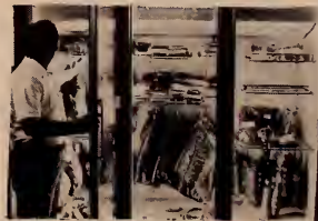
JIM OLIVER'S FAMOUS SMOKED COUNTRY HAMS AND MEATS

SPECIALIZING IN SMOKED COUNTRY HAM, BISCUITS, CATFISH, BAR-B-Q, VEGETABLES, CHARCOAL-BROILED STEAKS, A LARGE SALAD BAR FEATURING OVER 20 ITEMS AND FINE SOUTHERN HOSPITALITY! OUR HEARTH ROOM WILL ACCOMMODATE 100 PEOPLE FOR PRIVATE GATHERINGS