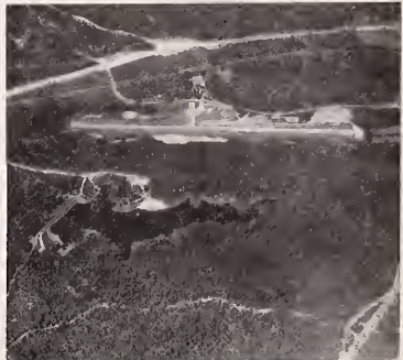
Sewanee Airport runway to be lengthened from 2860 to 3300 feet.