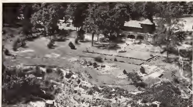
CLARAMONT CASTLE as seen from the air. . . Swimming pool in lower left-hand corner is set under the edge of the bluff.