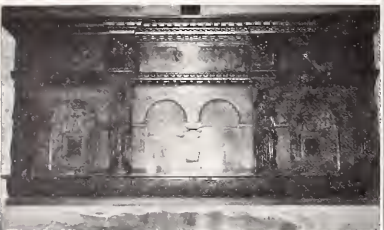
This is a view of the main dining room's mantle piece made in Jacobian period. Circa 1603 to 1649, during the reign of James I to Charles I. It came from a feudal castle at Somershire or Ironony-by-Bow in England.

She was interested. And thus it is that in the years to come students, alumni, and the Sewanee community will witness the return of the Mountain to Mountain traditions — the Claramont Castle.