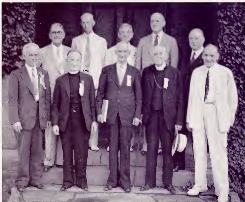
Members of ATO's Golden Circle Present at Reunion