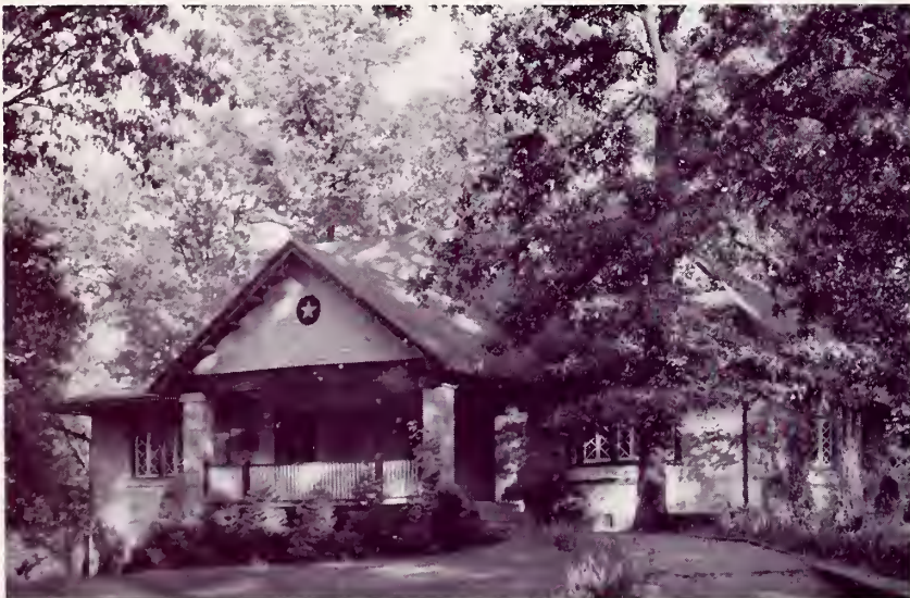
PHI GAMMA DELTA FRATERNITY HOUSE

Just a peek into the future will show you that we really mean what we have said. On Friday, June 7, we are going to have an open house for the Mountain, featuring a "Smorgesbord" piled high with delicious Swedish food. Sunday, a Tea will be held to those visiting the Mountain, with the theme of memories as the motif. So come to the Phi Gam house and help us make this a reality. Don't forget our 20th Anniversary, June 7-9.