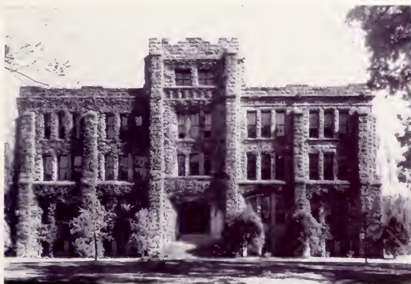
Carnegie Science Hall