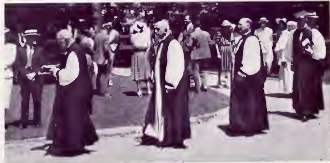
Views of Academic Procession at Commencement