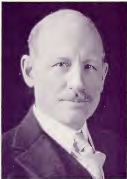
HON. FRANK PIERREPONT GRAVES Commencement Orator