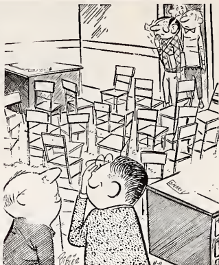
"I put a desk at each end of the classroom. It confuses hell out of those students who always sit on the back row!"

The way to counteract the bad faith spread by Soviet agents and, more important, to assist as free agents in resolving the problems faced in these areas, is certainly not to let both the Communists and the problems gain ground by default. To do nothing is to do more than that: it is to retreat