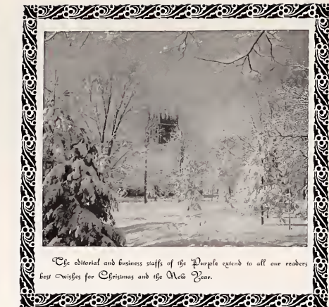
The editorial and business staff of the Purple extend to all our readers their wishes for Christmas and the New Year.

[Let your heart be comforted, O Master! We too may have our Fine Arts Center, by 1957, with Radio, TV, et cetera, and also the Big Gym with swimming pools and tap dancing. May you live long, and when you pass into the Beyond, may you speak your name as the fairest among the Brethren.—Editor.]