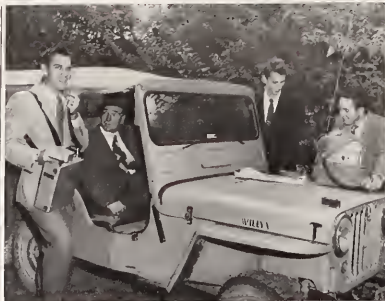
TRY OUT NEW RADIO—Students and forestry professors try out the new two-way radio which was purchased recently by the forestry department.

Applications will be accepted until further notice and must be filed with the Board of U. S. Civil Service Examiners for Scientific and Technical Personnel of the Potomac River Naval Command, Building 37, Naval Research Laboratory, Washington 25, D. C. Application forms may be obtained from your Placement Office, from most offices, or direct from the U. S. Civil Service Commission, Washington 25, D. C.