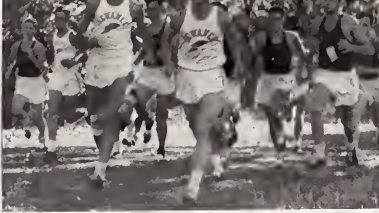
RACE BEGINS—Runners from Sewanee and Maryville break from the starting line in last Friday's cross country meet here. The Tiger breakers emerged victorious by a score of 27-28.