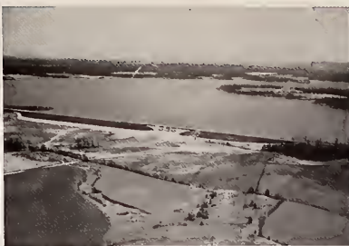
AEDC DAM COMPLETED —An aerial view shows the new AEDC lake near completion of the reconstruction program. The University of the South has been awarded a portion of the lake for biological research.