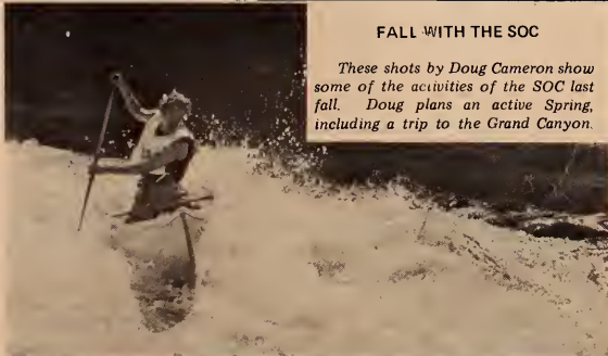
These shots by Doug Cameron show some of the activities of the SOC last fall. Doug plans an active Spring, including a trip to the Grand Canyon.