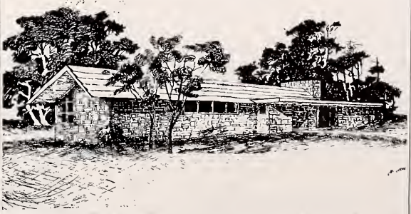
ARTIST'S SKETCH OF NEW BETA HOUSE—This modern stone structure will house the expanded facilities of Gamma Chi chapter. Plans call for functional beauty to accommodate social, recreational, and fraternal activities.

Early Ministry Much of his early ministry was spent in the West. He was born in Golden, Colorado, June 22, 1897, the son of an Episcopal clergyman. He was Vicar of St. James' Church, Paso Robles, California, from 1916 to 1918, and Rector of All Saints' Church, Watsonville, California from 1917 to 1920. He was Dean of Trinity Cathedral in Reno, Nevada, (Continued on page 4)