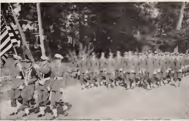
PARADE IN TRACY CITY—The Elite Flight of the Sewanee Air Force ROTC Unit parades through Tracy City on its way to the fair grounds where the ROTC drill squad presented a fancy drill exhibition for the entertainment of those present at the Grundy County Forest Festival last Friday.

Fifty Studies of Nashville has completed the individual portraits of students and these will be offered for sale by a studio representative within the next few weeks. The portraits will be on sale for one week.