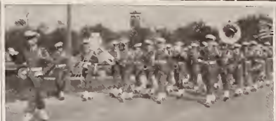
BAND PERFORMS —The Sewanee AF ROTC band marches through Tracy City on their way to the fair grounds. The group later presented a concert at the Grundy County Forest Festival. (Story on page one)