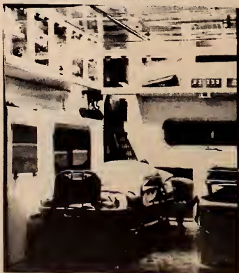
A look inside the new SEMS modular ambulance

"We are here for the community. We enjoy what we do, and input and support are always appreciated," Farr said. A town the size of Sewanee is very fortunate to have access to a modular ambulance and trained personnel, he said. SEMS looks forward to increased participation in the future.