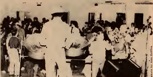
The crowd goes wild to the beat of the steel drum.