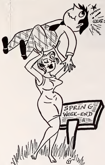
FIGURE your own caption!