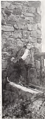
The Norman Gate