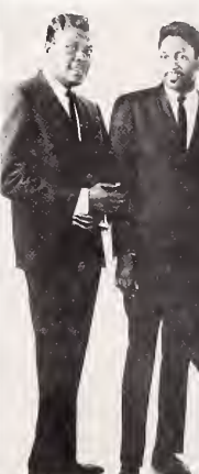
THE COASTERS play at Gym on Friday night.

iliary dedicated themselves to finding the ideal means of bringing a maximum amount of fun to the people of the Mountain. Instituted as a non-profit phenomenon, the show received such a high degree both of participation