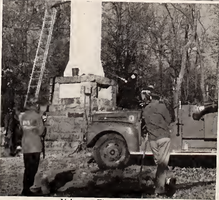
Volunteer Firemen Scrub Cross